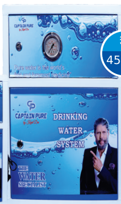
CP 40 60 LPH RO