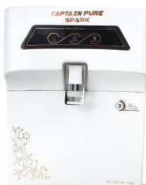
WHITE CP 18