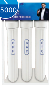
CP 73 100 LPH RO