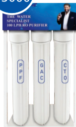
CP 72 50 LPH RO