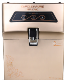
COPPER CP 05