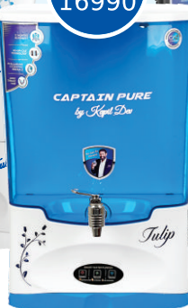
Tulip Blue CP 43