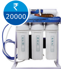
CP 71 25 LPH RO