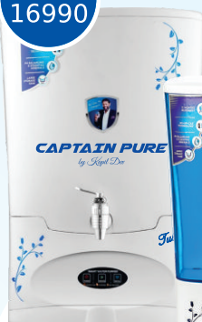
Tulip White CP 16