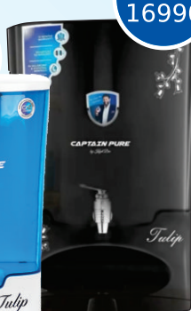
Tulip Black CP 17