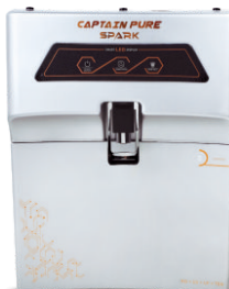
SILVER CP 04