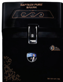
BLACK CP 19