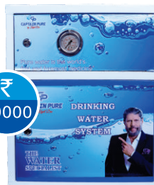
CP 39 30 LPH RO